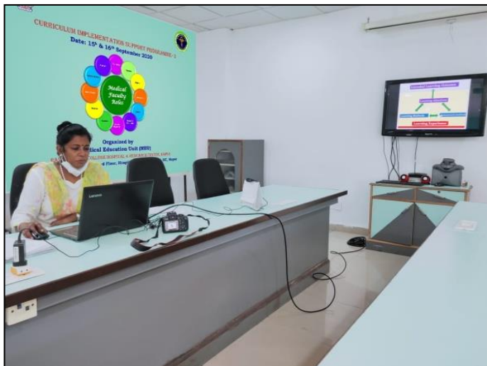
Ongoing Online Session