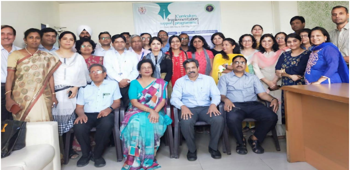
Group Photograph of CISP-I